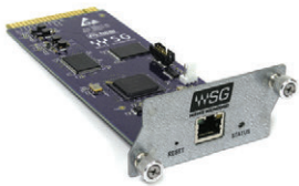
Waves SoundGrid Card Connects 16 channels of simultaneous audio in/out with SoundGrid-enabled equipment