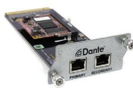
Dante Card Connects 16 channels of simultaneous audio input/output with Dante-enabled equipment