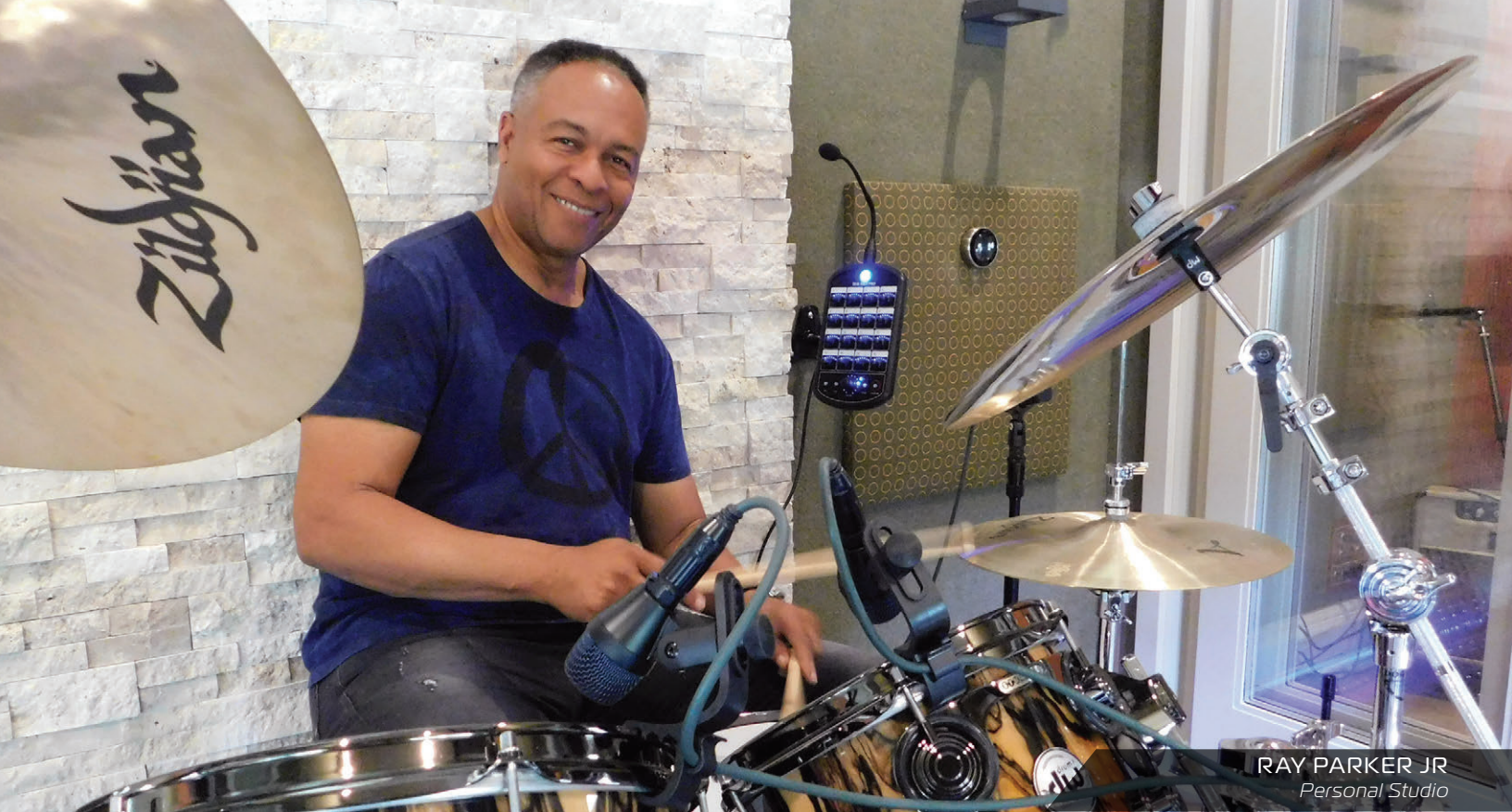
RAY PARKER JR Personal Studio