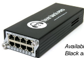
Available in Black and Silver