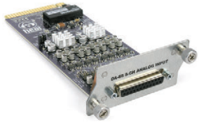
Analog Card (8) Balanced audio inputs using standard Tascam DA-88-style pin-out DB25 connector