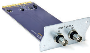
Word Clock Card Precise external system clock automatically detects sampling rate with BNC in/out connections