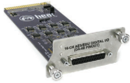
AES/EBU Card DB25 to (8) XLR (each AES/EBU XLR connector supports 2 channels of digital audio)