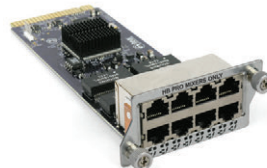
Network Card (8) RJ45 gigabit Ethernet ports for connecting PRO Mixers, PRO Distros, or other PRO Hubs