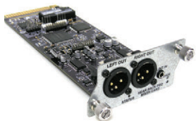
Virtual Mixer Card All the features of the PRO Mixer in a card format controlled via iOS device or another PRO Mixer