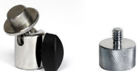
Mixer Tilt Adapter 5/8"