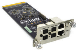
ADAT Card (2) Optical ADAT TOS-Link ins (2) Optical ADAT TOS-Link outs (2) RJ45 HearBus outs