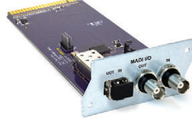
MADI Card (Coming Soon) Optical and Coaxial MADI ins/outs connect 32 channels with PRO Hub and 64 channels with WSG Bridge