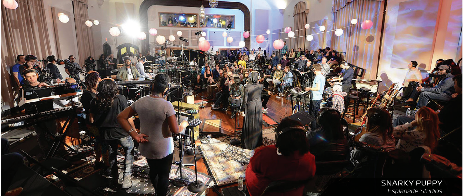
SNARKY PUPPY Esplanade Studios