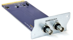
Word Clock Card Precise external system clock automatically detects sampling rate with BNC in/out connections