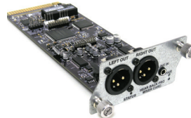
Virtual Mixer Card All the features of the Hear Back PRO Mixer in a card format controlled via iOS device or another PRO Mixer