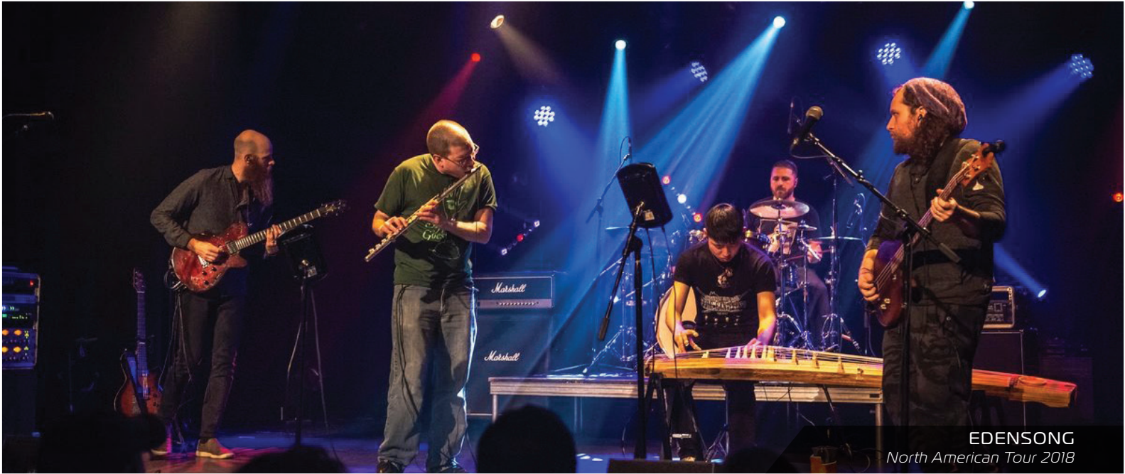
EDENSONG North American Tour 2018