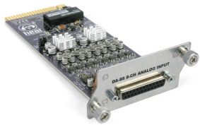
Analog Card (8) Balanced audio inputs using standard Tascam DA-88-style pin-out DB25 connector