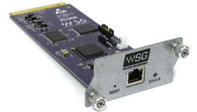
Waves SoundGrid Card Connects 16 channels of simultaneous audio in/out with SoundGrid-enabled equipment