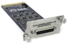
AES/EBU Card DB25 to (8) XLR (each AES/EBU XLR connector supports 2 channels of digital audio)