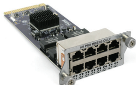
Network Card (8) RJ45 gigabit Ethernet ports for connecting PRO Mixers, PRO Mixer Distros, or other PRO Hubs