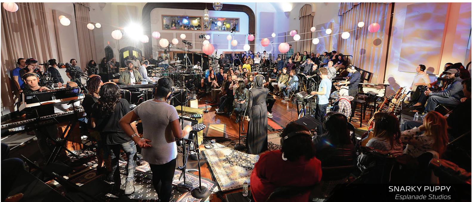
SNARKY PUPPY Esplanade Studios