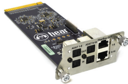
ADAT Card (2) Optical ADAT TOS-Link ins (2) Optical ADAT TOS-Link outs (2) RJ45 HearBus outs