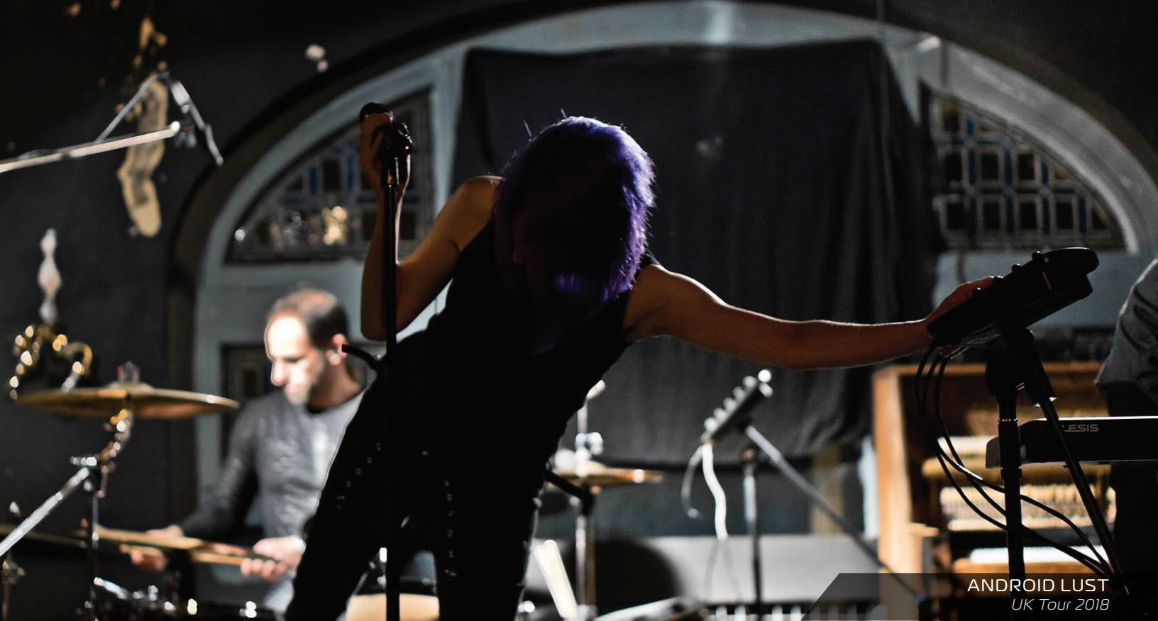
ANDROID LUST UK Tour 2018